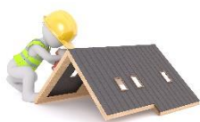
Step 4 Practical training of young adults renovating flats