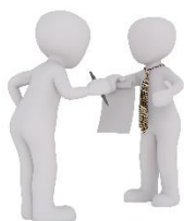
Step 1 Hiring trainers preparing training program

For the implementation of the training programme five steps have been necessary: