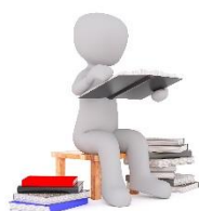
Step 3 Technical training of young adults