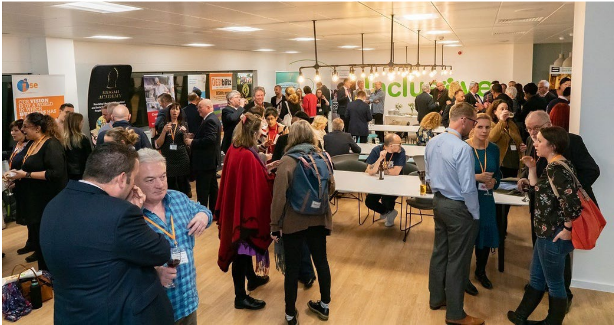
SOHO Micro Fund event