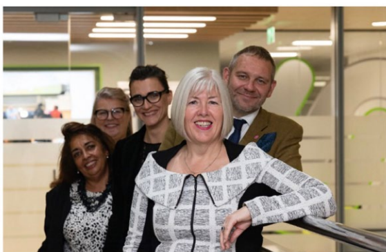
The Use-IT! newsletter

Important for all these elements were to make them known to the diverse target groups and explain the benefits of them. Here the Brokerage and Communication Manager has been a key providing the USE-IT! partners with professional communication and promotion support. For instance, by producing flyers for workshops and recording results on videos and in social media posts or by co-producing events with the USE-IT! partners and livestreaming them on Facebook. In addition, a series of films were produced to promote the project at USE-IT! events. Newly developed social enterprises were supported in their social media presence.