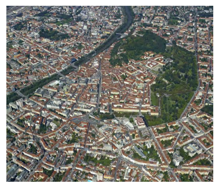
The Old Town of Graz

To be successful Cultural Heritage Management Plans need to set out a clear integrated strategy with tangible