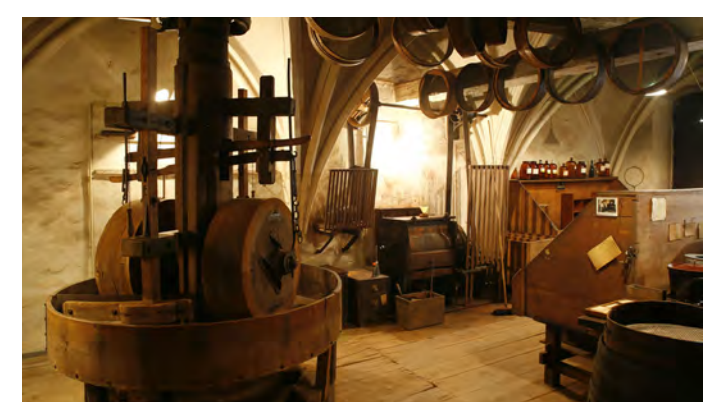
ERDF-funded museum 'document Schnupftabakfabrik' (Snuff Tobacco Factory) in Regensburg

See the List of HerO Flagship Projects funded by structural funds (4)