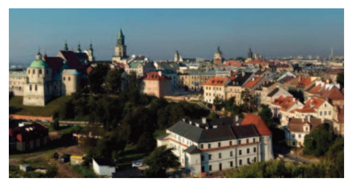
The Old Town of Lublin, Poland

A coherent European Cultural Heritage strategy within the European Cohesion Policy is needed to provide effective guidance to EU institutions and member states on realising the potential wide ranging benefits from investing in heritage. The development of integrated cultural heritage management strategies could be considered for example as prime examples for sustainable urban development. Evidence and case study examples of the benefits of investing in heritage can also be found in the Interreg funded project INHERIT.