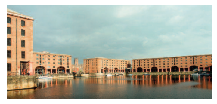
Albert Dock, Liverpool Liverpool is partner in the HerO network and EAHTR member city