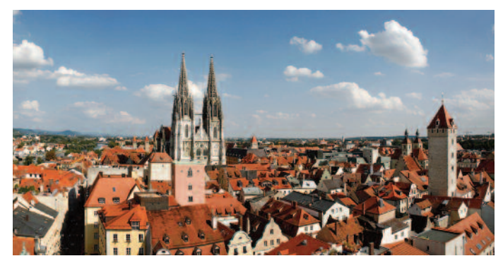
The Old Town of Regensburg, Germany

The HerO partner cities are Regensburg (Germany, Lead Partner), Graz (Austria), Naples (Italy), Vilnius (Lithuania), Sighişoara (Romania), Liverpool (United Kingdom), Lublin (Poland), Poitiers (France) and Valletta (Malta).