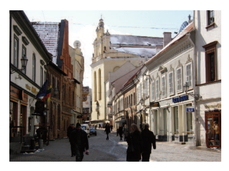
Pilies Street in Vilnius, Lithuania